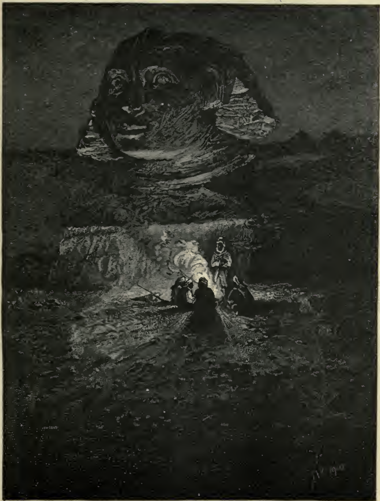
" EGYPT." Page 390.